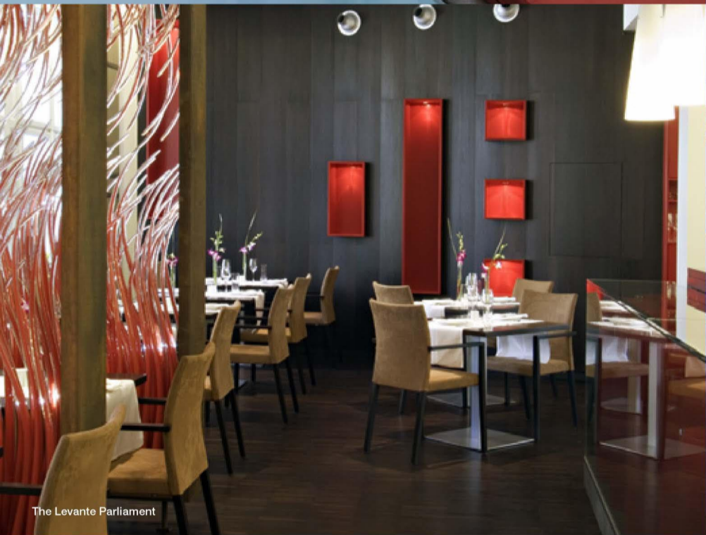
The Levante Parliament