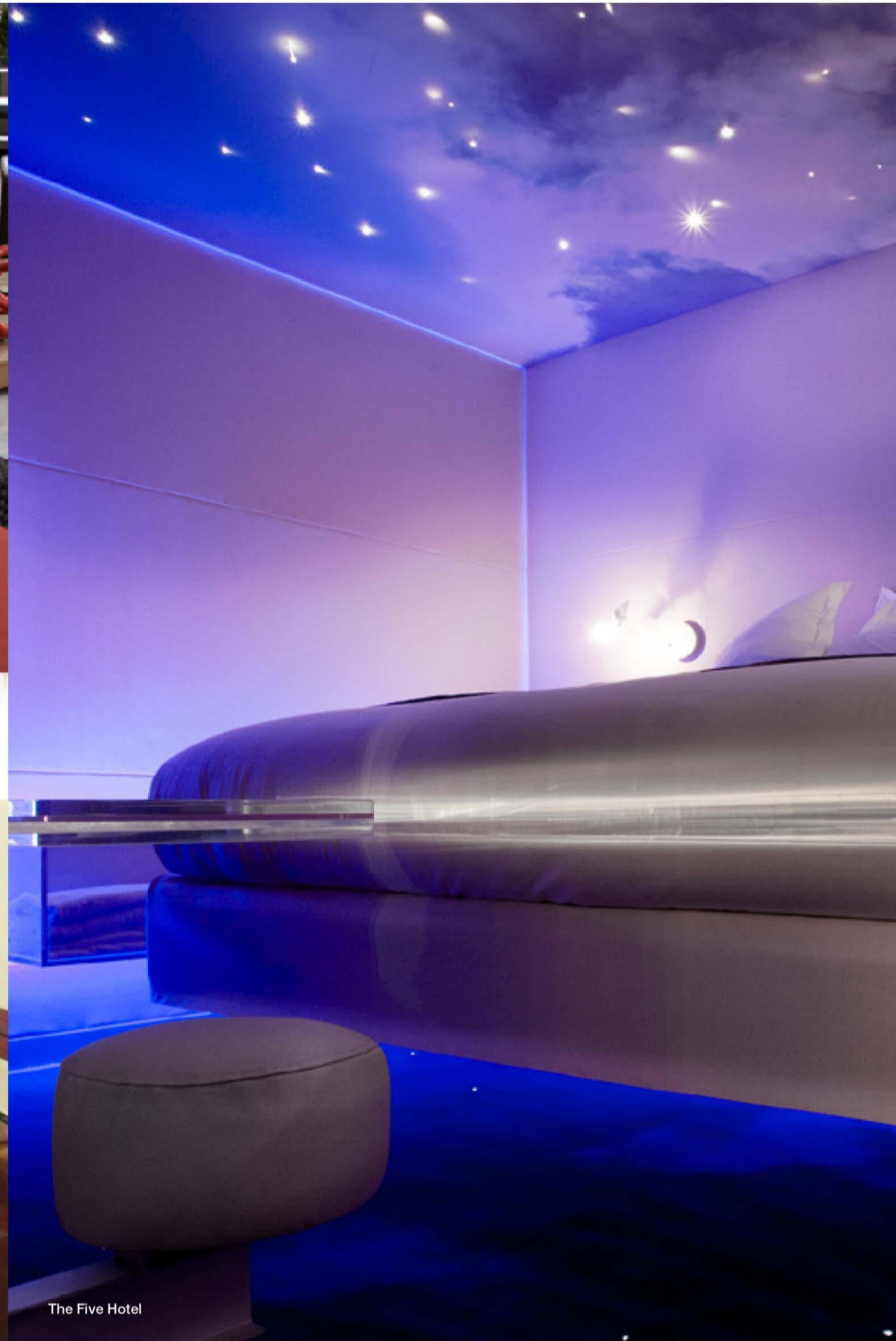
The Five Hotel